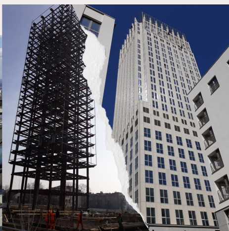
On the left, coordination of work on the construction site of a 102-meter tower in Krakow (10 years of work).